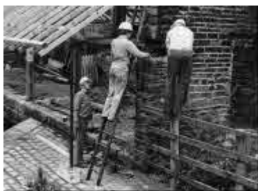
The Warehouse During Restoration