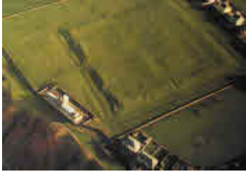
Maryport Roman Fort

The audience were told of the difficulty in locating some of the remains and shown slides and drawings of the towers and mileforts. The Roman forts on the frontier are at Beckfoot, Maryport, Burrow Walls, Moresby and Ravenglass all of which Ken illustrated with slides and plans .