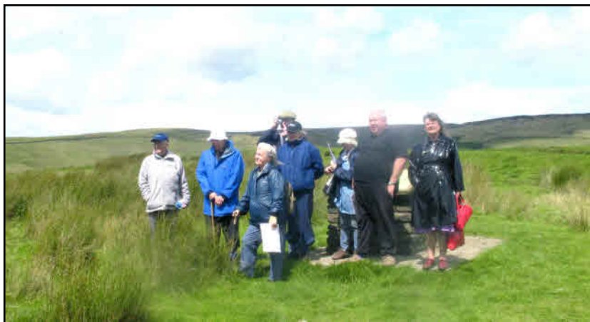
The Roman Antiquities Section of the Yorkshire Archaeological Society